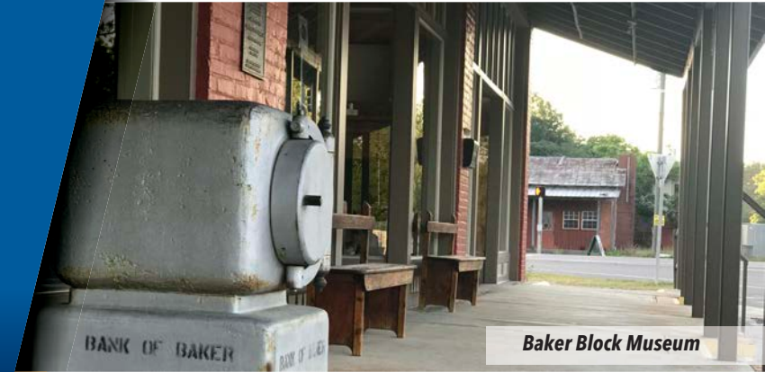
Baker Block Museum